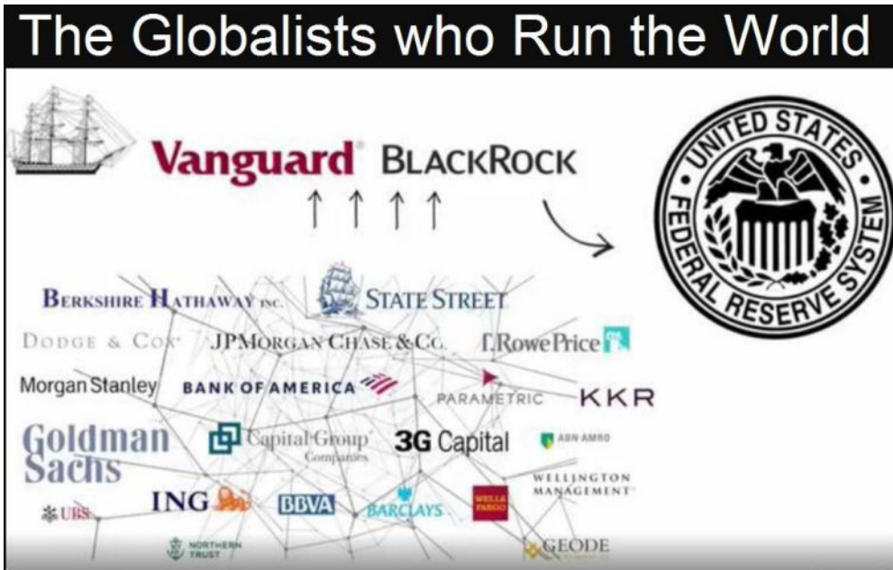
Original Image Source: Vanguard and BlackRock Own the World