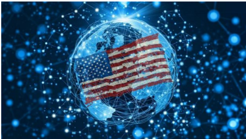
Click to see the full-size image