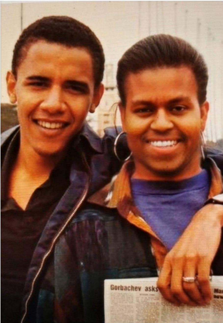
*It has been brought to our attention that this photo has been altered.

Now take a closer look at Big Mike below posing as Michelle Obama, author of “Becoming” (becoming a woman?!), in 2013.