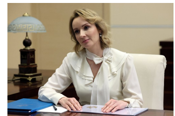
Indicted War Criminal Maria Lvova-Belova

But as a result of this sensible humanitarian policy, both Russian President Vladimir Putin and Maria Lvova-Belova, the Russian Commissioner for Children's Rights, were indicted as war criminals by Europe's International Criminal Court (ICC) in the Hague, which issued international arrest warrants against them , an act of total lunacy.