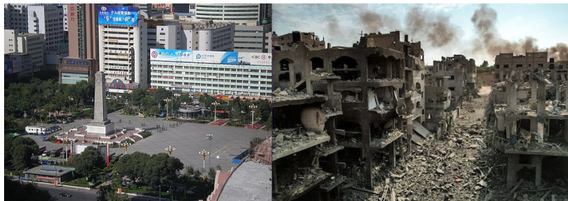
Scenes from the Uighur "Genocide" Compared to Those of the Palestinian "Genocide"

Still, fair is fair, and less than three years ago both the Trump and the Biden Administrations had officially declared that China was committing "genocide" against the Uighurs of its Xinjiang province, a charge widely echoed in the Times and across the rest of our media. Yet oddly enough, none of those horrific accusations ever pointed to the killing of a single Uighur by the Chinese government, and there is also a very notable contrast between the shining Uighur cities, with their modern, unblemished office buildings and residential towers, and the current ruins of devastated Gaza. So if the West could claim that China was committing a Uighur "genocide," the Israelis certainly stand massively convicted of that monstrous charge, even made explicit by Netanyahu's public statements.